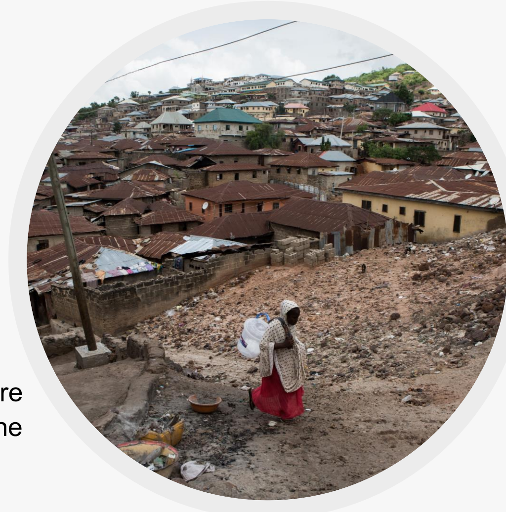
Lokoja, Kogi State

Why? Women and men with disabilities in Kogi face similar barriers experienced by people with disabilities in the rest of Nigeria and other developing countries, including limited access to education, employment and health services, and are exposed to worse health outcomes compared to the rest of the population