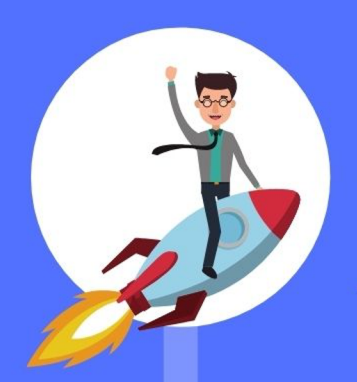
YEES Able to Start Their Journey